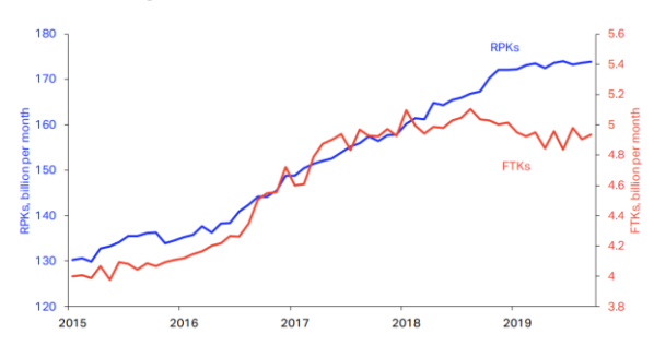
Figure 1: Growth in air passenger travel and cargo, 2015 through 2020 (forecast)

We expect passenger traffic growth will slow this year, as will growth in world trade, particularly if the coronavirus outbreak in China proves difficult to contain (Figure 1).